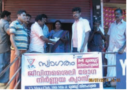
'Muthoot Snehasraya' medical camp for the prevention and early detection of kidney related diseases in Kerala