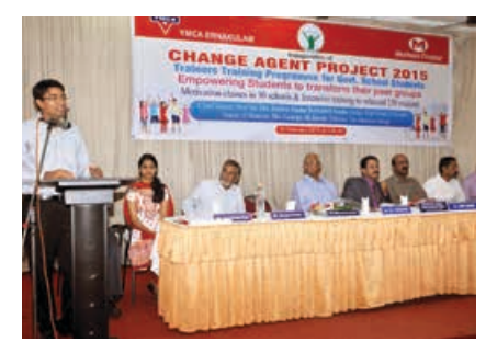
Training programme for govt. school students