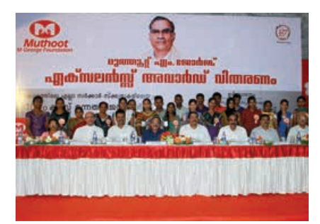
Muthoot M George Excellence Award to the 10th standard toppers of all govt. schools in Kerala