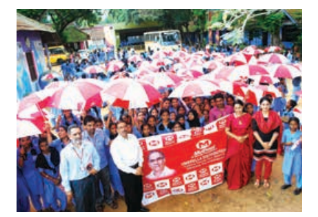
Umbrella distribution to schools in Kerala