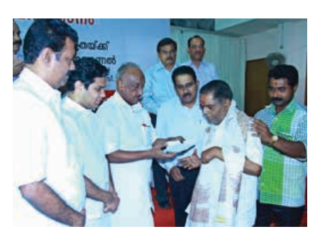
'Muthoot Snehasammanam'- Financial assistance to artist, authors and their widows in Kerala