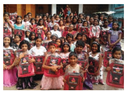
School bag distribution in schools