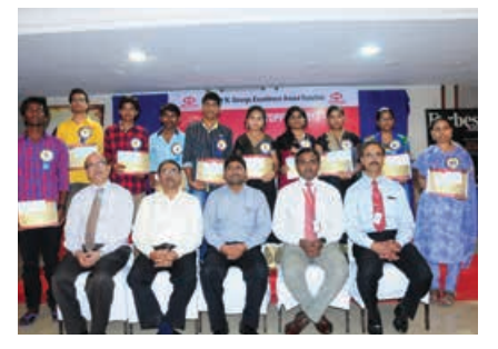
Muthoot M George Excellence Award to the 10th standard toppers of govt. schools in Telangana