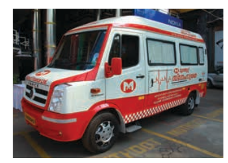
'Muthoot Snehasraya' mobile laboratory for the prevention and early detection of kidney related diseases in Kerala