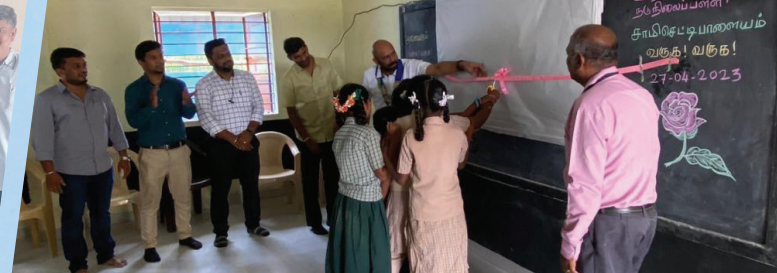
Govt. High School - Malumichmpatti- Coimbatore District.